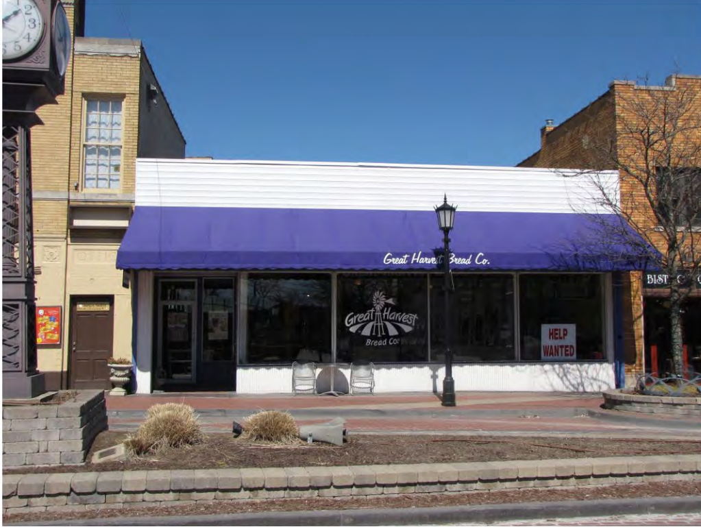
Main East 139_Looking North