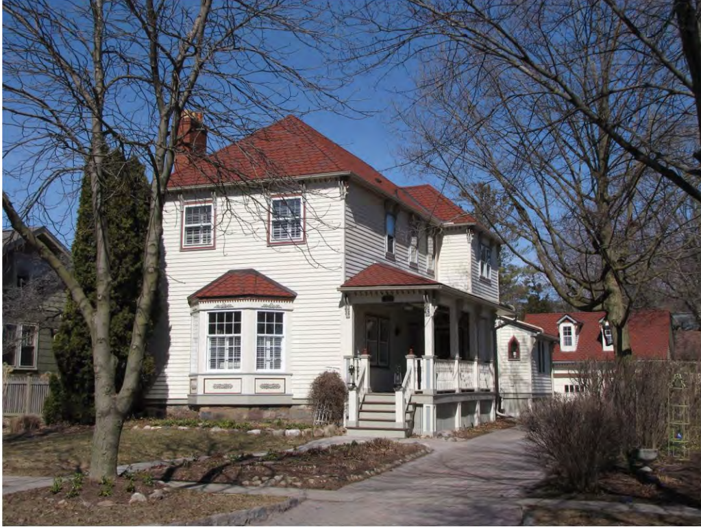
Dunlap West 310_ Looking Northwest