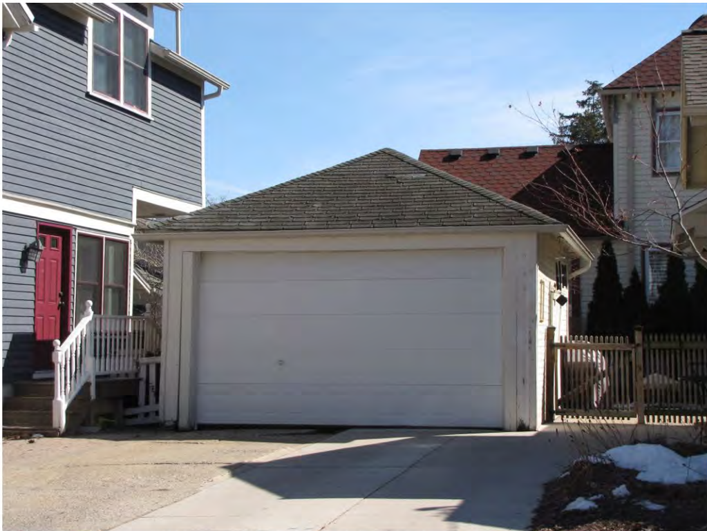
Dunlap West 314, Garage_ Looking East